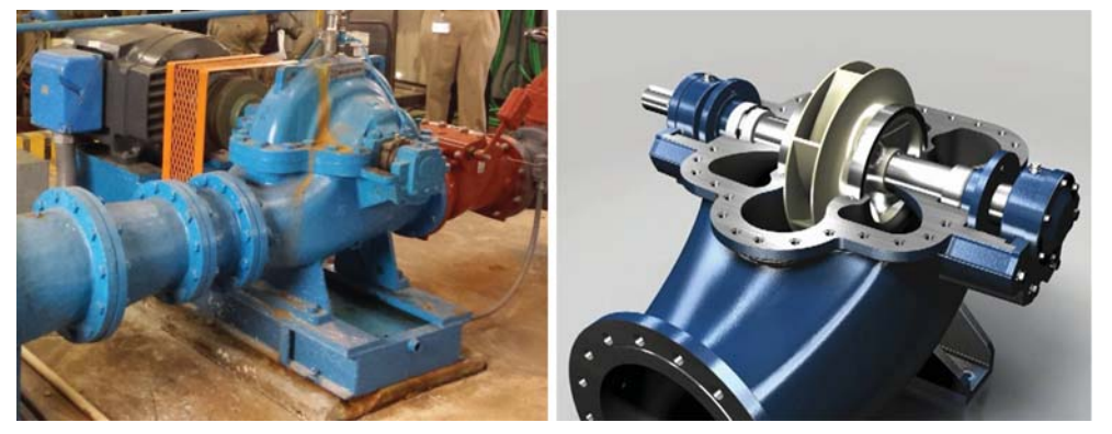
Figure 1. Horizontal split case pump in a pump station building (left) and the same kind of pump with the top case removed (right).

The pump is double suction, which means that liquid may enter the center of enclosed im