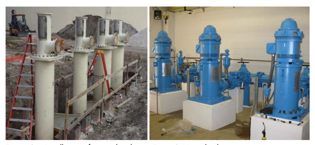
Figure 2. Installation of vertical turbine pumps in barrels; motors have not yet been installed.